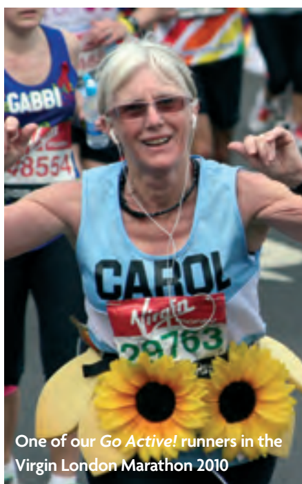
One of our Go Active! runners in the Virgin London Marathon 2010

Check out our Go Active! diary on the back page. If you're looking for something different, get in touch and we'll help you to find the challenge or activity for you – perhaps you'd prefer a parachute jump?!