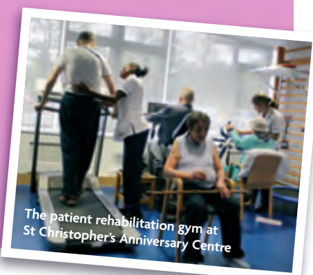
The patient rehabilitation gym at St Christopher's Anniversary Centre

"We had a lovely lunch and I met some other people going through the same sort of things. My nurse caught up with me and we had a private chat and checked out all my pills. People don't realise that to get all this done in one go changes everything."